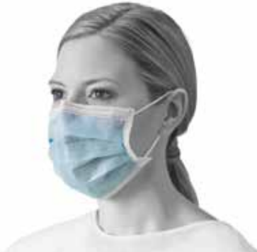
NON27378 Procedure Face Mask 50/bx, 6 bx/cs