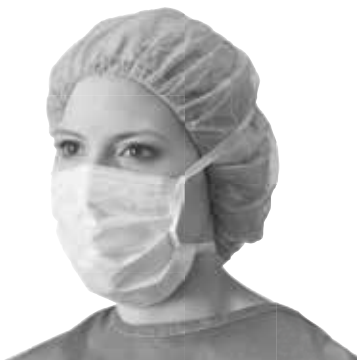
NON27385 Hypoallergenic Surgical Face Mask 50/bx, 6 bx/cs