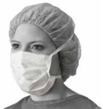
NON27386 Sensitive Skin Surgical Face Mask 50/bx, 6 bx/cs