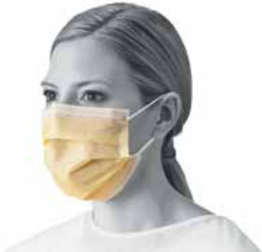
NON27122 Isolation Face Mask 50/bx, 6 bx/cs