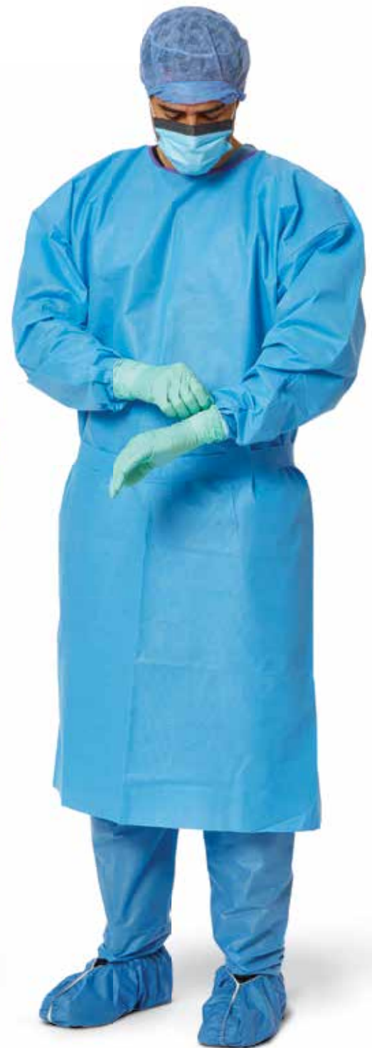
A Housewide, Med/Surg and ICU