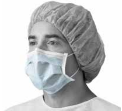
NON27375 Procedure Face Mask 50/bx, 6 bx/cs