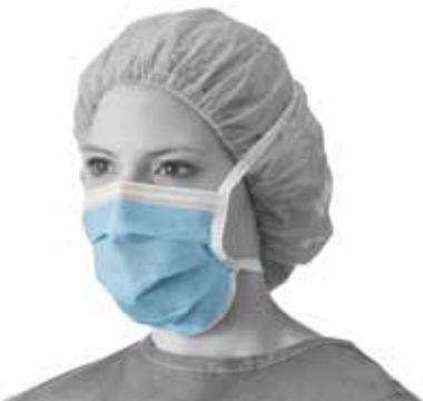
NON27402 Surgical Face Mask 50/bx, 6 bx/cs