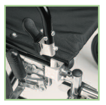
Quick-release flip-back arms Make transfers easy. Available on 4000 models.