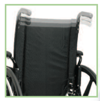
Height adjustable back Included on 4000 models.