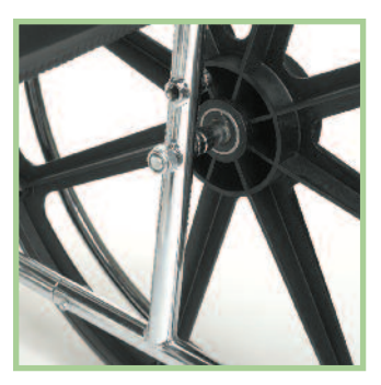
Dual axle Allows seat to be easily lowered to hemi height. Available on 2000, 3000 and 4000 models