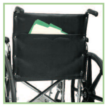
Chart pocket Included on 2000 and 2000HD models.