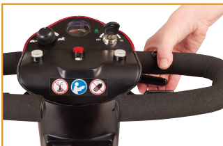
EZ Reach tiller adjustment