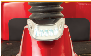
Angle adjustable LED headlight creates a wide path of bright light