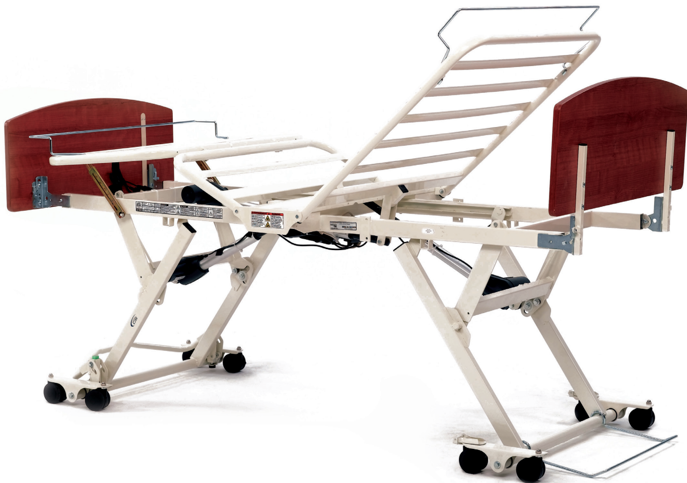
CS5 bed featured Belmont Bed Ends