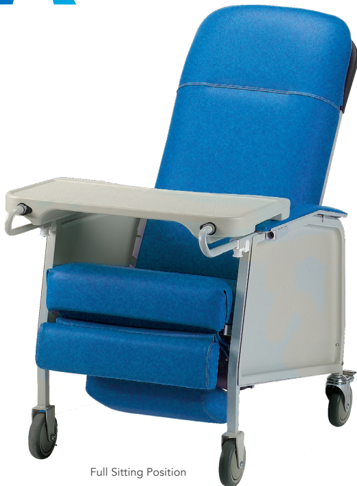
Full Sitting Position