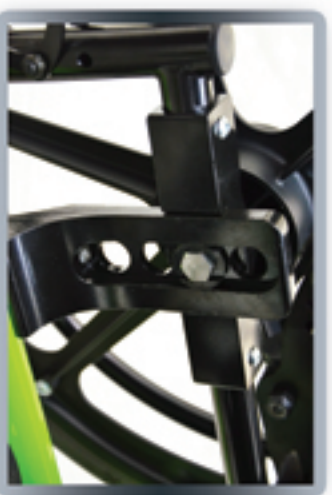
Axle plate allows many different seat to floor heights and center of gravity adjustment Quick release axle (optional)