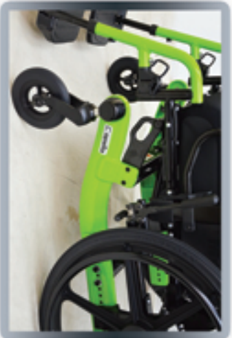
Adjustable front fork angle