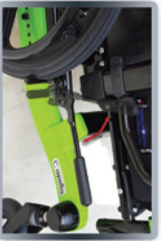
Wheel lock available in both push or pull to lock options Brake extension built into handle