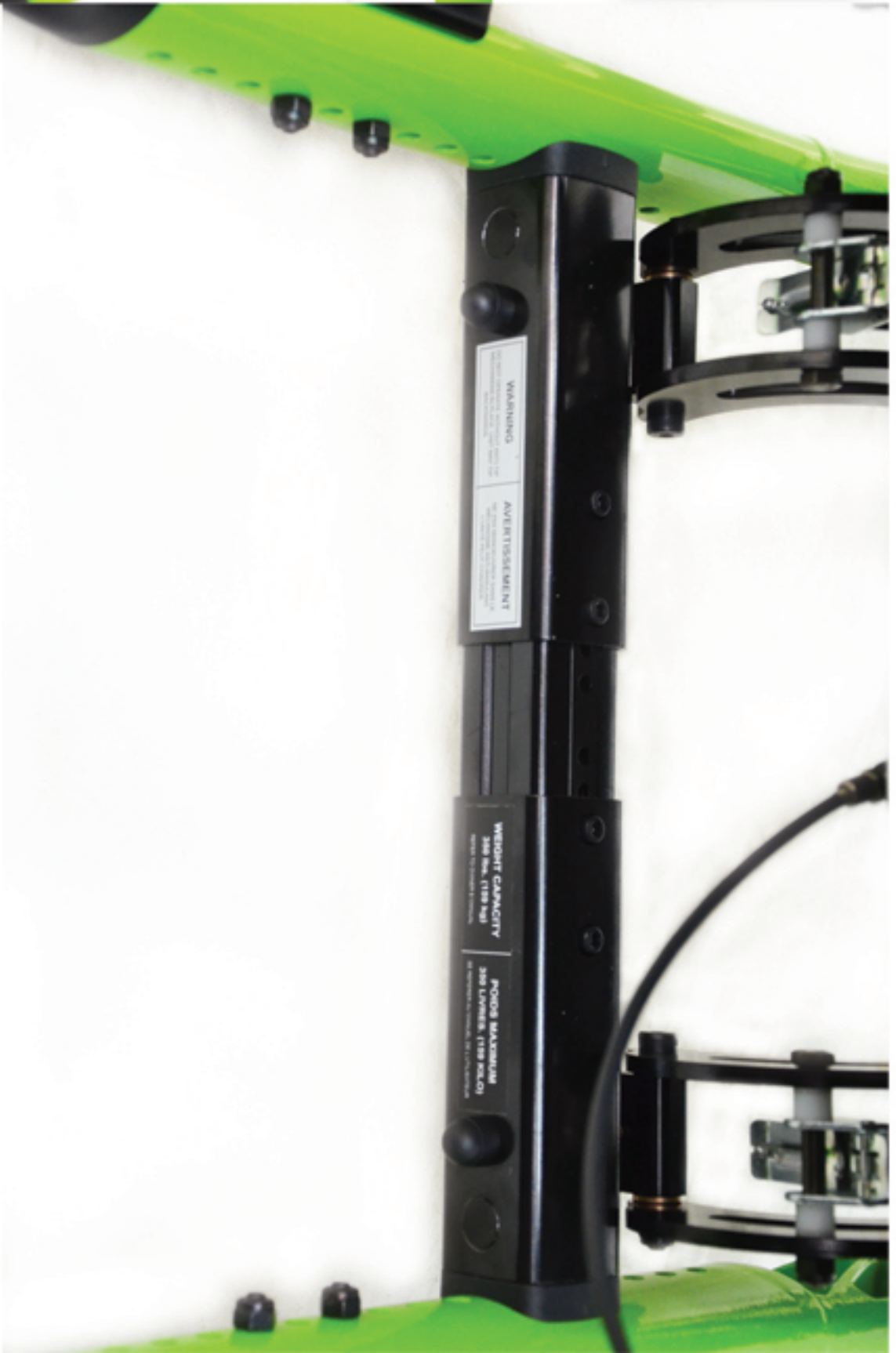
Chair width adjustable from 16"-20" or 20"-24"