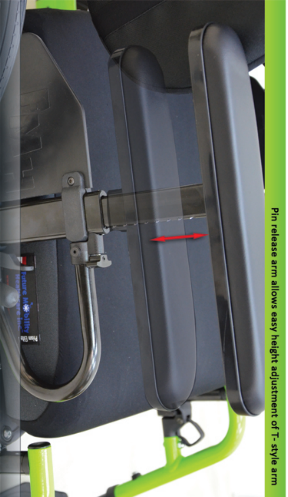
Pin release arm allows easy height adjustment of T-style arm