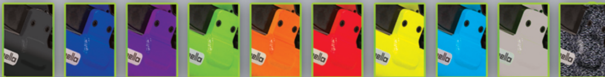
Wet Black Cobalt Blue Purple Grape Green Orange Fire Red Yellow Sky Blue Silver Lining Silver Vein