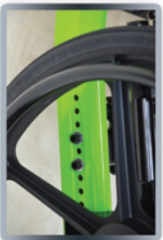
Adjustable Axle plate position