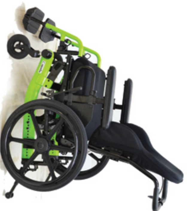
20 degrees of tilt