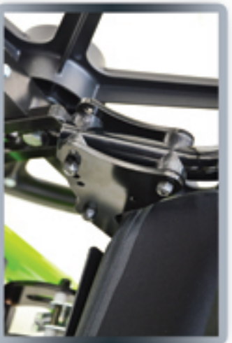
Adjustable back cane angle (83° to 111°)