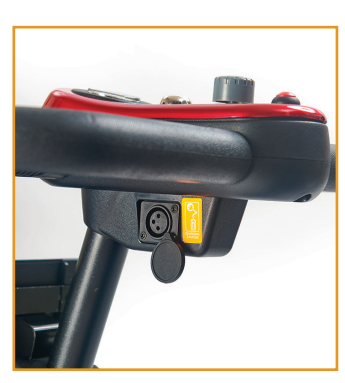
Conveniently located charging port on the delta tiller.