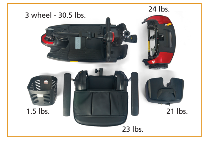
Quickly disassembles into five, lightweight pieces for easy transport!