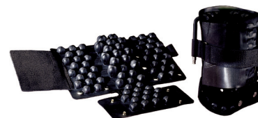
ROHO® HEAL PAD® Cushion