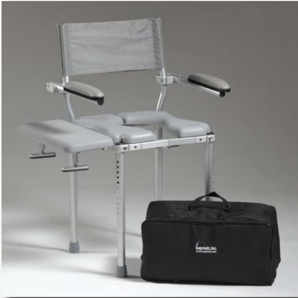
MULTICHAIR 3000Tx (carrying case included)

The lightest, smallest, and best portable tub transfer bench / commode chair available. So small that when folded and packed it can fit on your lap, and with its standard-equipment carrying case, it complies with FAA requirements for carry-on luggage. It's so compact, it can fit underneath most standard wheelchairs.