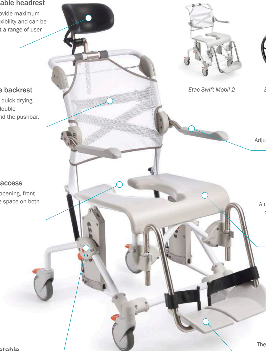
Etac Swift Mobil Tilt-2

The gently curved footplates provide instep and arch support, ensuring comfort, stability and relaxation.