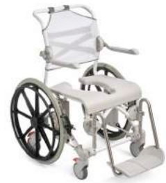
Etac Swift Mobil 24"-2