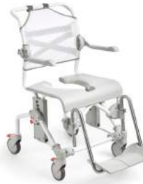
Etac Swift Mobil-2

Easy to adjust to different fixed seat heights, without using tools.