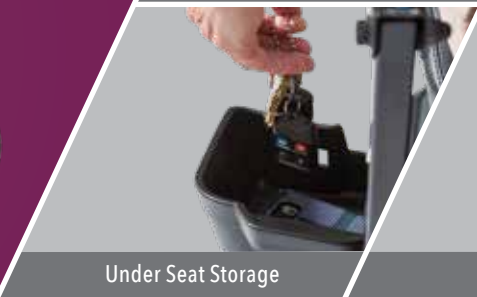
Under Seat Storage