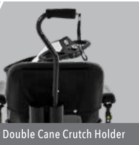
Single or Double Cane Crutch Holder