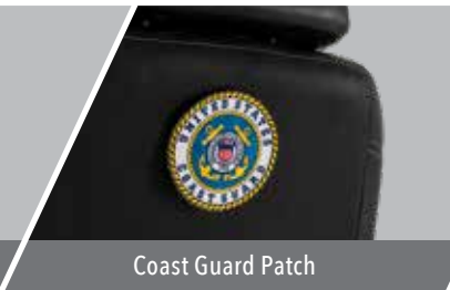
Coast Guard Patch