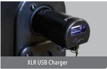
XLR USB Charger