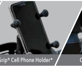
RAM® X-Grip® Cell Phone Holder*