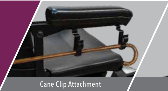
Cane Clip Attachment