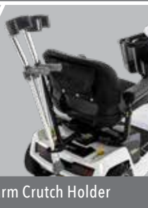
Forearm Crutch Holder