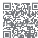
Power Lift Recliner Accessories

1. Pride® FDA Class II Medical Devices are designed to aid individuals with mobility impairments.