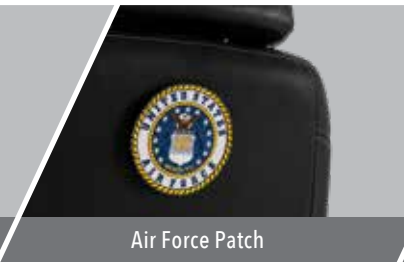
Air Force Patch