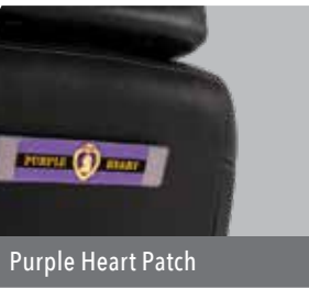
Purple Heart Patch