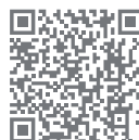
Jazzy Power Chair Accessories