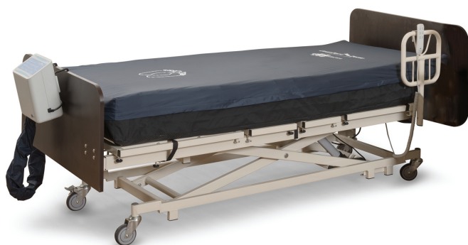
Therapeutic Support Mattress Replacement System Designed to prevent, treat and manage pressure ulcers