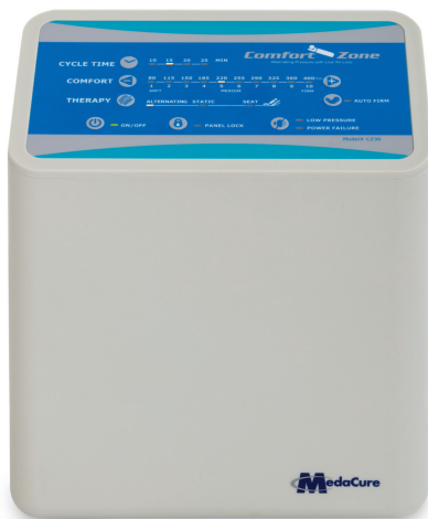
Whisper Quiet Digital Pump

POLY/PU QUILTED COVER FOR ULTIMATE IN PATIENT COMFORT