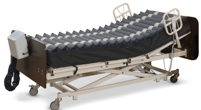
Alternating Pressure with Low Air Loss Cell-on-cell Design Prevents Bottoming Out