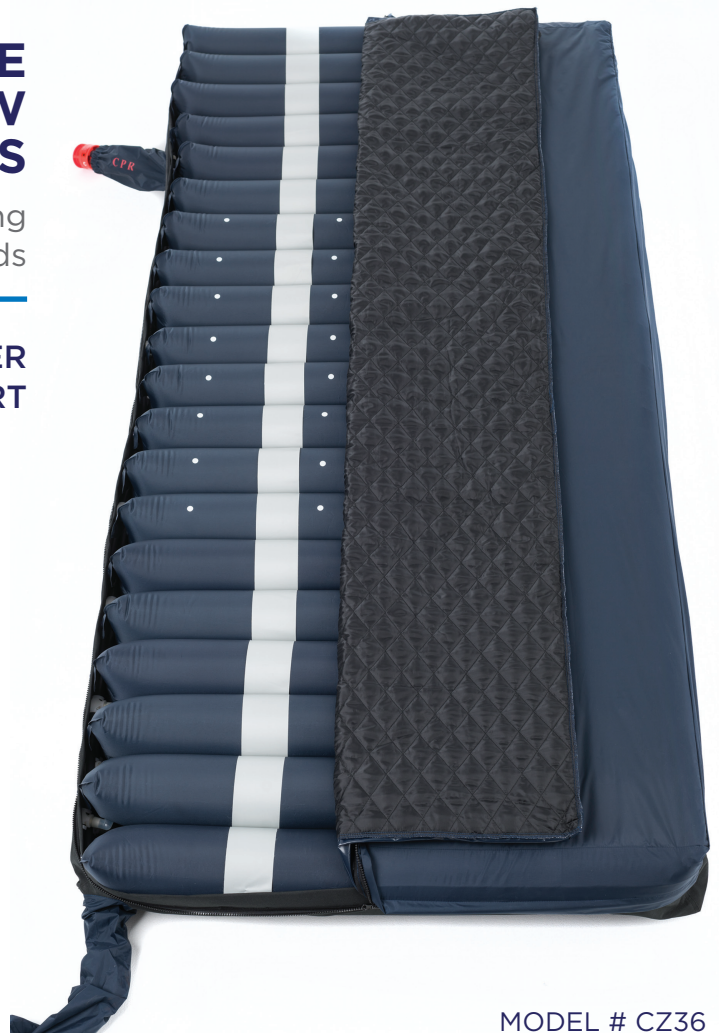
MODEL # CZ36