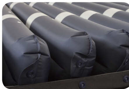
EZ SNAP-IN-SNAP-OUT REPLACABLE CELLS