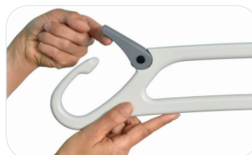
Unique Secure Sling Mechanism

Product Specifications Monarch Portable Hoist