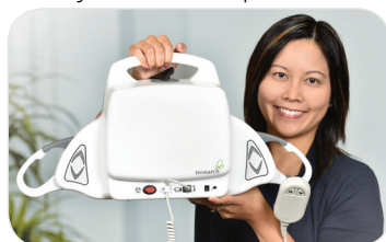
Easy Transport Handle