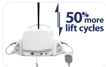
50% more lift cycles