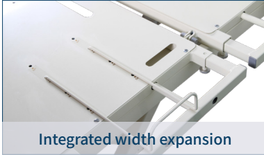
Integrated width expansion