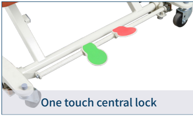
One touch central lock