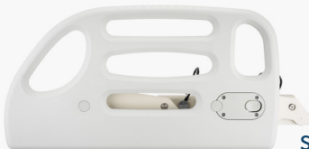
Soft Style Side Rails