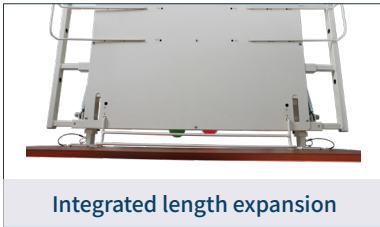
Integrated length expansion