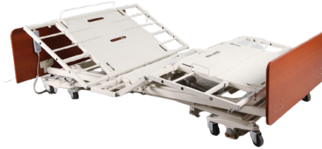
Integrated width expansion