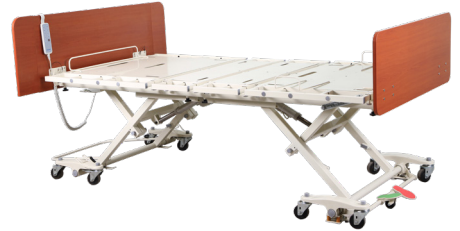
Mobility at any height