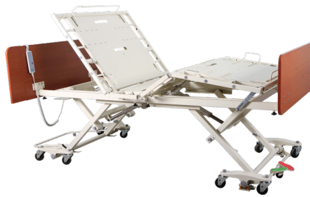
Comfort chair position