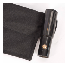
2" Seat extension