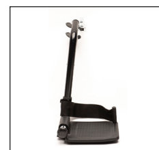
Swing-away footrests with heel loops