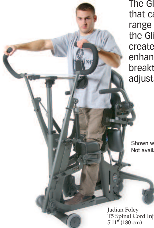
Shown with options Not available in XT size

Jadian Foley T5 Spinal Cord Injury 5'11" (180 cm)