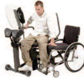
The Shadow Tray and kneepads flip out of the way for an easy transfer.

The Shadow Tray option features a supportive tray with chest pad that follows the user from sitting to standing. It is ideal for people with moderate to severe levels of disability, school settings, or for a person with a recent spinal cord injury. This breakthrough method of standing provides the user with anterior support that remains with them as they move from sitting to standing. People who can only stand partially upright still have complete access to the tray, while remaining fully supported. The Evolv Shadow Tray includes a contoured chest pad.