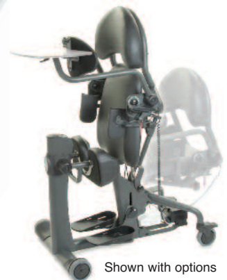
Shown with options