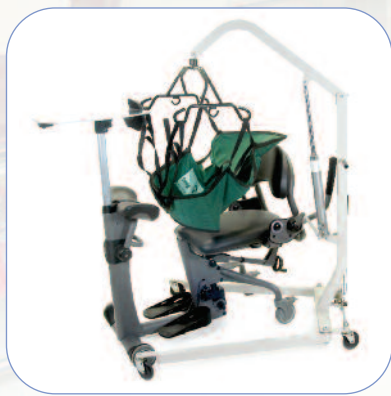
The Evolv has an open base and elevated rear legs for users who transfer with a patient lift.

With over fifty options and configurations to choose from, the EasyStand Evolv is the most modular stander available. It is highly adjustable for multi-user settings or to accommodate growing teens. When a child grows out of the Evolv Youth, a Growth Kit can be purchased to convert it into an Evolv Adult.