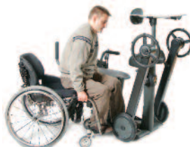
Kneepads and pushrims move forward for transferring.

For those who want to move around the house and focus on function while standing, we have created the self-propelled Mobile option. To maximize transfer room, the pushrims move forward when the kneepad is flipped up. Utilizing a high efficiency chain drive, the drive wheel and push rim mechanisms are closer to the user, improving propulsion and steering. Wheel locks secure the stander while transferring and provide safe stationary standing. Most people who can propel a manual wheelchair can use the Evolve Mobile. It includes a clear acrylic tray.