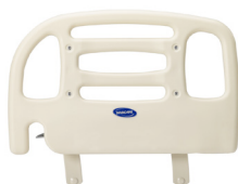
Invacare® ThinkSoft® Positioning Device