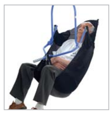
All-day mesh sling