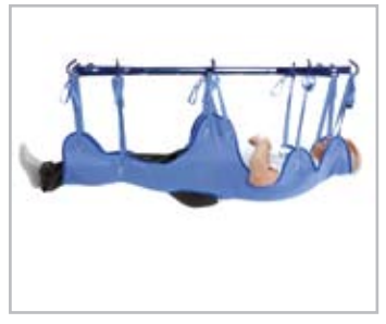
Stretcher sling with commode aperture

• Available with or without commode aperture, in standard or mesh fabric or as a Flite (patient specific) version.