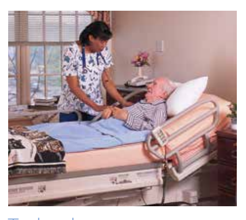
Technology Outcome-based solutions

Hill-Rom offers a wide array of products and services to complement the Hill-Rom® Resident® LTC Bed, including: