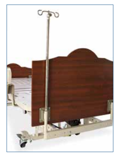
Standard drainage hooks and IV pole mounts can aid caregivers and residents.

The Hill-Rom® Resident® LTC Bed accommodates a wide variety of prevention mattresses and treatment surfaces.