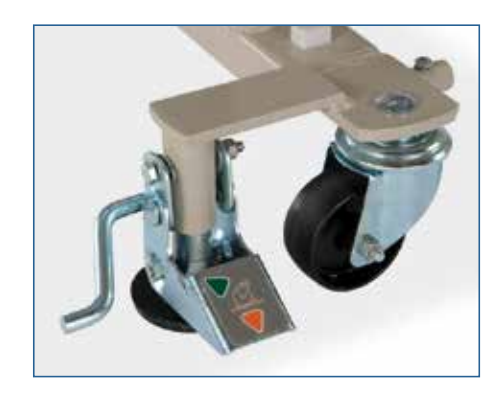
Locking casters allow for easy relocation and positioning within the room.