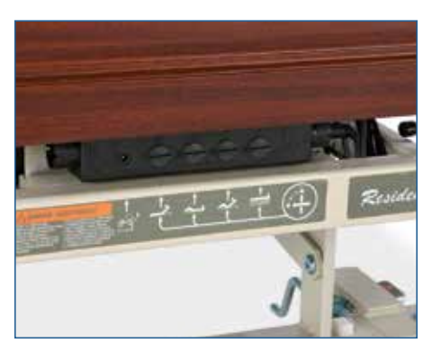
Footend control lockout panel helps create a safer resident environment.