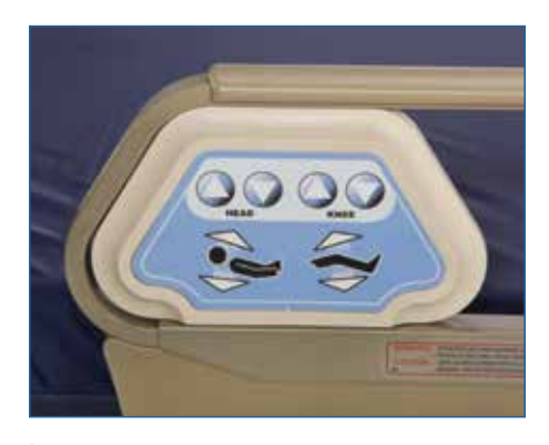
Large, easy-to-see, easy-to-operate siderail-mounted controls enhance resident comfort and independence.