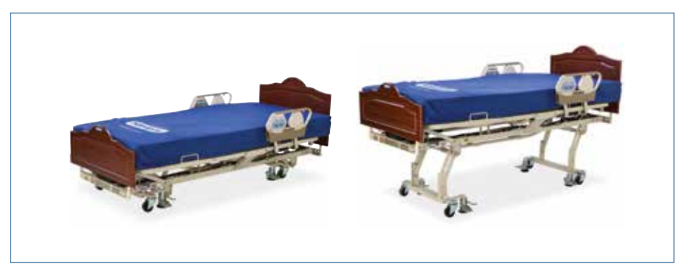
Electric high/low movement facilitates resident egress and provides comfortable working height for caregivers.