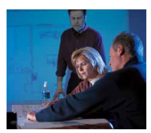
Process National service network