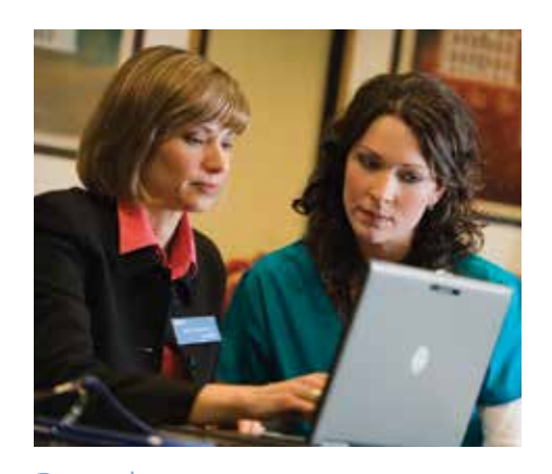
People Clinically-trained sales force